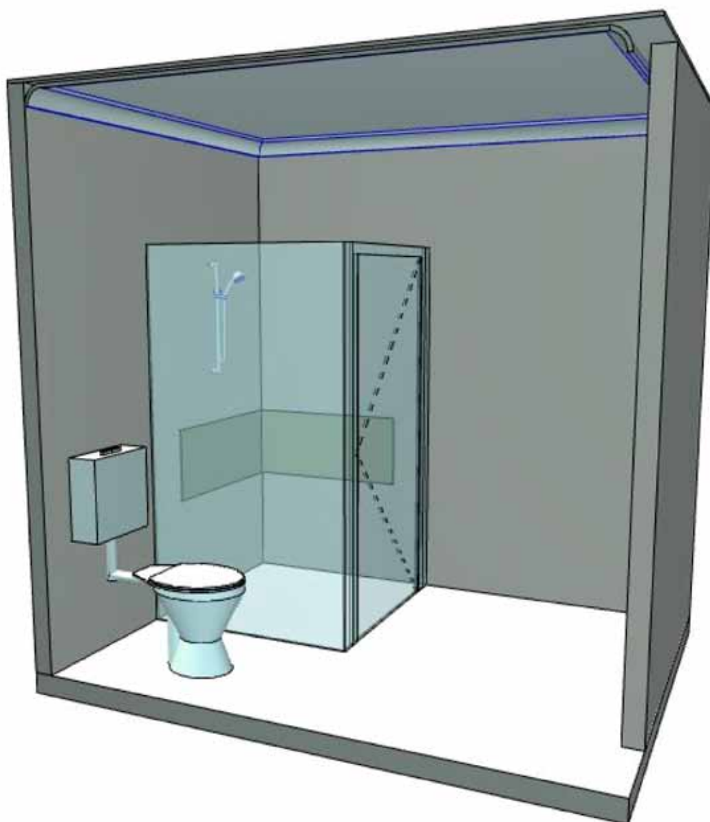
Figure 11. Shower perspective

This information was sourced from the national Livable Housing Design Guidelines produced by the National Dialogue on Universal Housing Design.