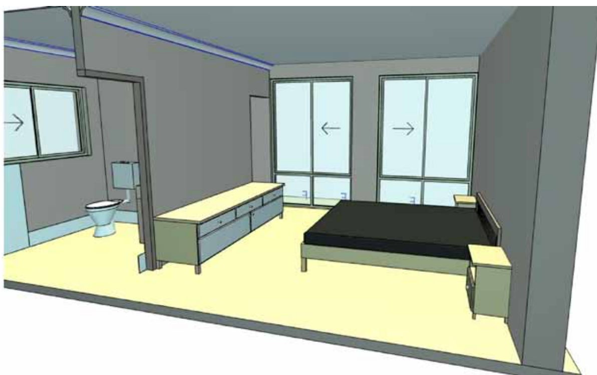
Figure 21. Bedroom perspective

This information was sourced from the national Livable Housing Design Guidelines produced by the National Dialogue on Universal Housing Design.